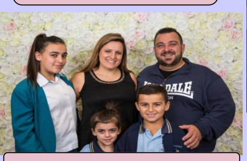
Our terrific organising committee