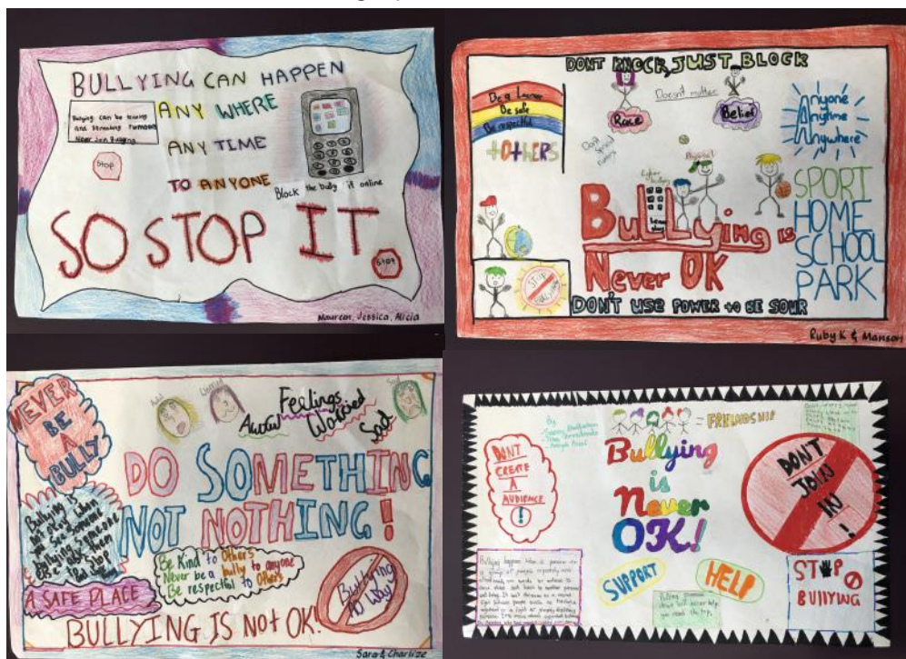
Posters created by Stage 2