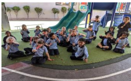
Today ES1 enjoyed making and eating fruit kebabs for their health lesson.

Pastoral Care Policy, Mandatory Reporting and School Procedures, Critical Incident Management and evidence of Evacuation and Lockdown Drills, Medication Policy and Teacher Accreditation.