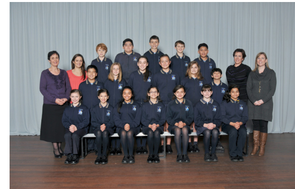
Congratulations Year 6 2013