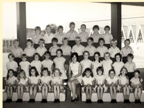
1973 Year 2 Blue