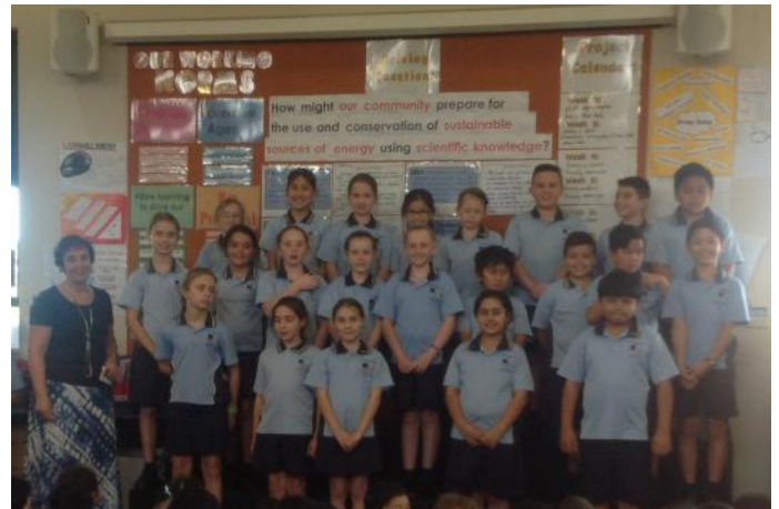
Remembrance Day at St Monica's 11 November 2015