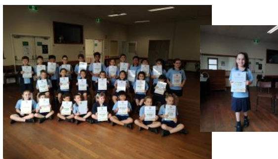
Bronze & Silver Awards